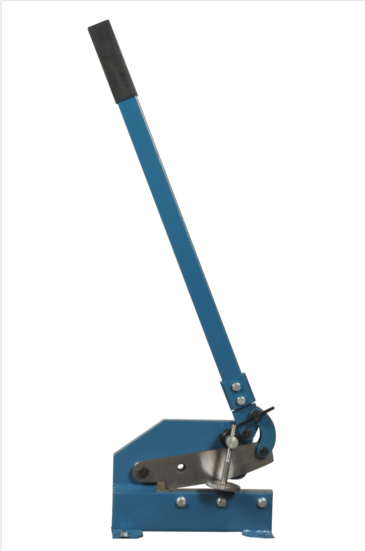
Plate and bar stock shear